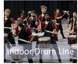
Indoor Drum Line