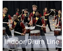
Indoor Drum Line