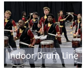
Indoor Drum Line